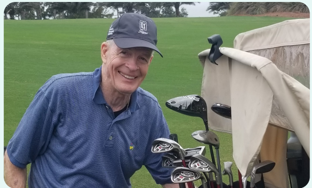
Area golfers hit the links at Mulligans for the Mission (formerly THE TRADITION) at TPC Sawgrass in October to raise funds for our community outreach programs.